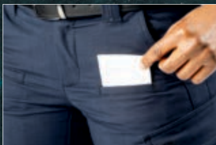
Cargo pants include 2 glove pockets