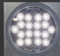
Safety Evacuation Lights