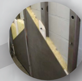
HIGH TEMPERATURE PROTECTION SYSTEM