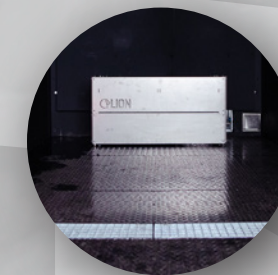
STAINLESS STEEL BURN TRAY & PILOT PLATE