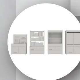
INTERCHANGABLE FIRE PROPS